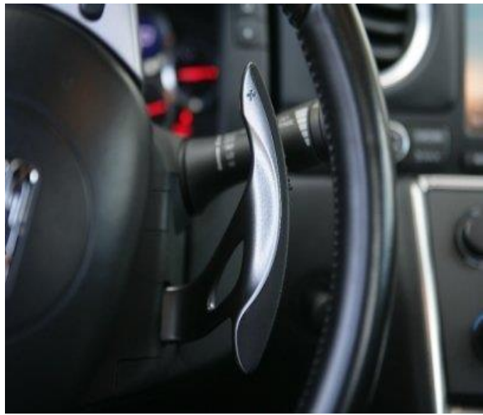
Figure 4: Semi-Automatic based steering [4]

Also known as an "automatic manual" or "clutch less manual" transmission, the simplest way to describe this type is to call it a hybrid between a fully automatic and manual transmission. Similar to a manual transmission, gears are changed via a simple shifter or paddles located behind the steering wheel. However, there is no need to operate a clutch pedal. Processors, sensors, pneumatics and actuators are all used to "automatically" shift the gears once the drive has signaled the change.