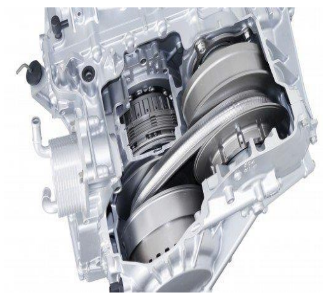
Figure 5: Continuously Variable Transmission system [2]

Unlike the others on this page, this transmission doesn't use gears as its means of producing various vehicle speeds at different engine speeds. Instead of gears, the system relies on a rubber or metal belt running over pulleys that can vary their effective diameters. To keep the belt at its optimum tension, one pulley will increase its effective diameter, while the other decreases its effective diameter by exactly the same amount. This action is exactly analogous to the effect produced when gears of different diameters are engaged.