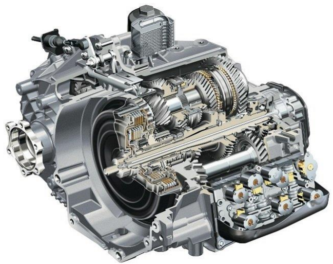
Figure 3: Semi-Automatic Transmission system [3]

Also known as an "automatic manual" or "clutch less manual" transmission, the simplest way to describe this type is to call it a hybrid between a fully automatic and manual transmission. Similar to a manual transmission, gears are changed via a simple shifter or paddles located behind the steering wheel. However, there is no need to operate a clutch pedal. Processors, sensors, pneumatics and actuators are all used to "automatically" shift the gears once the drive has signaled the change.